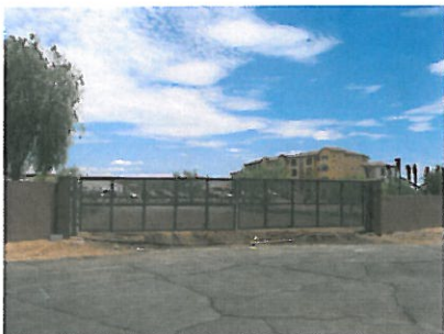
gate behind buildings 4 & 5