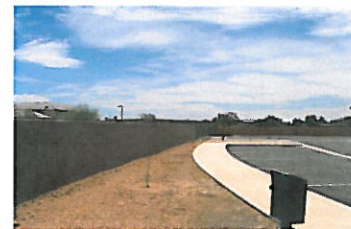
wall behind Bldg. 7