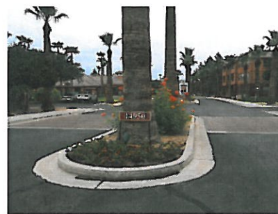
LaSolana address number sign